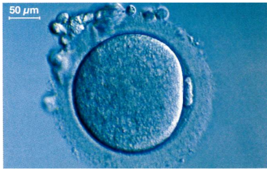
Human ovum observed through microscope (SVT 4 e , Didier 2007)